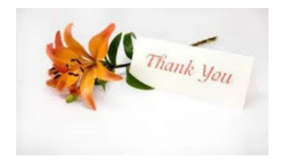
Thank you for your continued support of Pure Bio